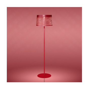
Twiggy Grid Lettura