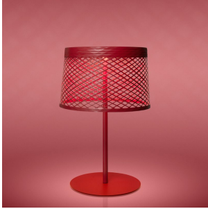
Twiggy Grid XL