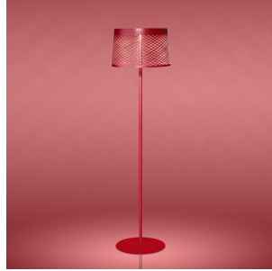
Twiggy Grid Lettura